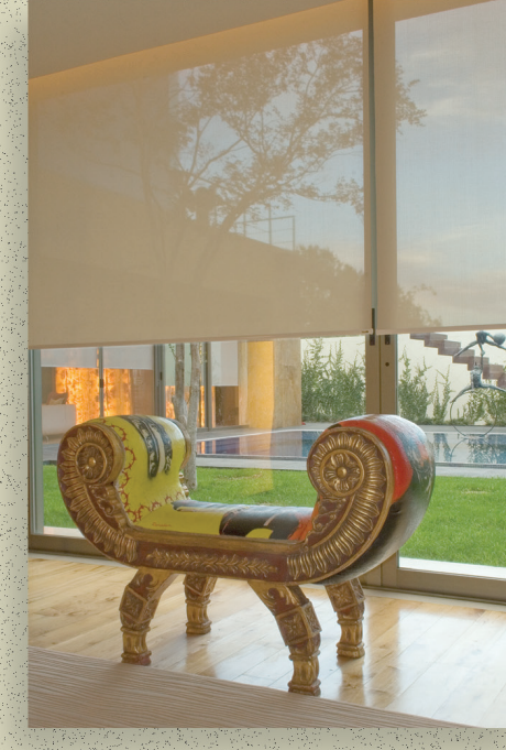
Photo courtesy of Shades de México, dba Tecnoline Shades. Guadalajara, México.